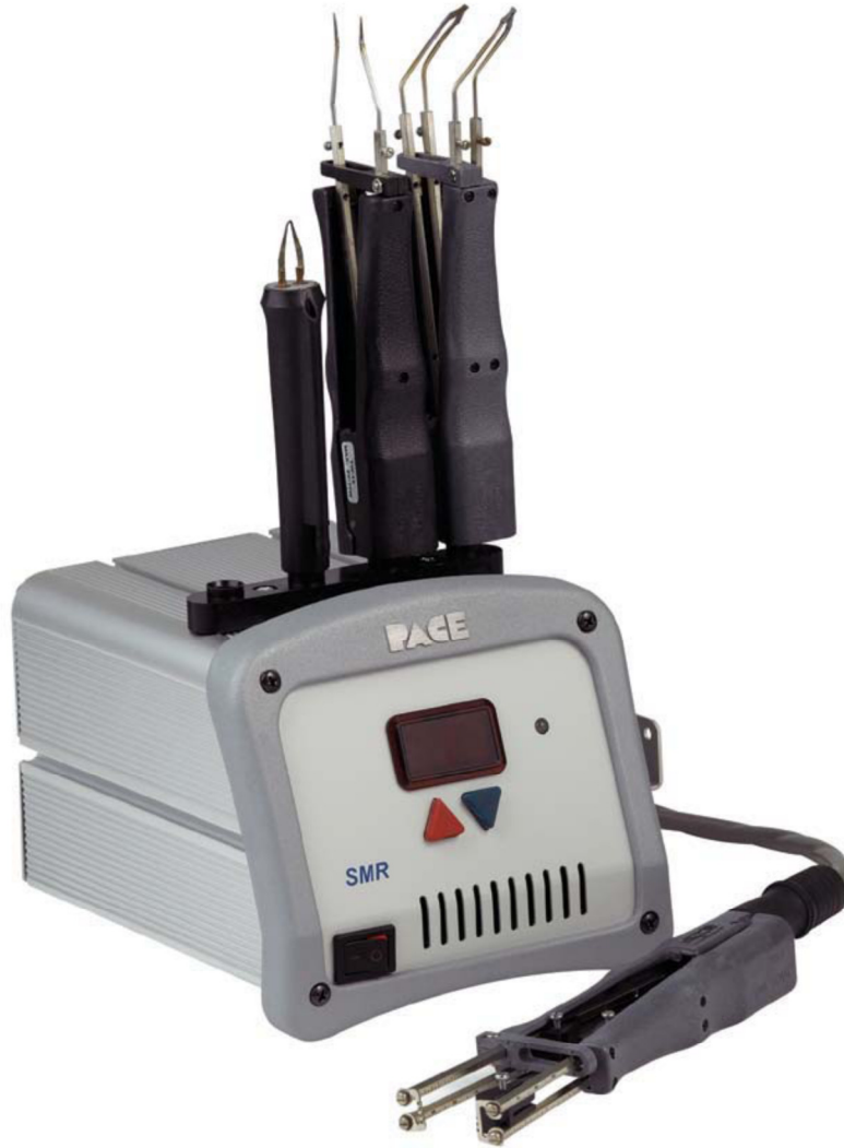
SMR Power supply (Shown with three optional handpieces and the connected TS-15 StripTweez)